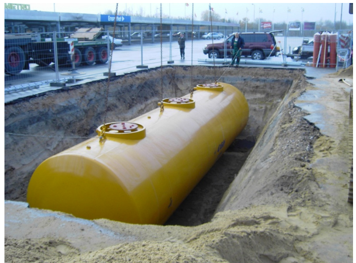
60 m 3 double skinned tank in 3 compartments