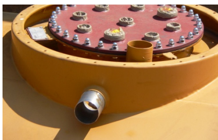
DN600 man way with frame for installation of access shaft, including stainless steel drain pipe

The tanks are available with a wide selection of accessories such as anchoring systems, sumps, street covers, pipes, overfill protection etc.