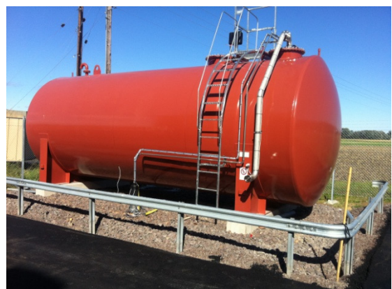
50 m 3 tank diameter 2900 mm. Ladder, platform and railing on top of tank. Fill point to ground level.