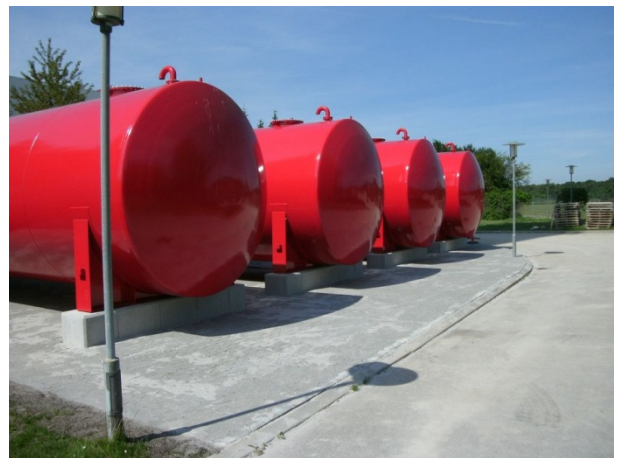
4 x 100 m 3 tanks diameter 2900 mm