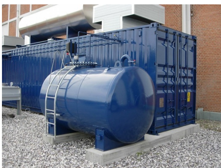
5 m 3 tank diameter 1600 mm

The tanks are available with a wide selection of accessories such as ladder / platform / railing, platform for a pump, roof, complete piping, overfill protection etc.