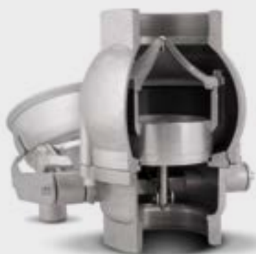
Cross section of an OPD, rear view.

The working principle of the devices is the same, especially the closure by hydraulic pressure to prevent liquid overflowing.