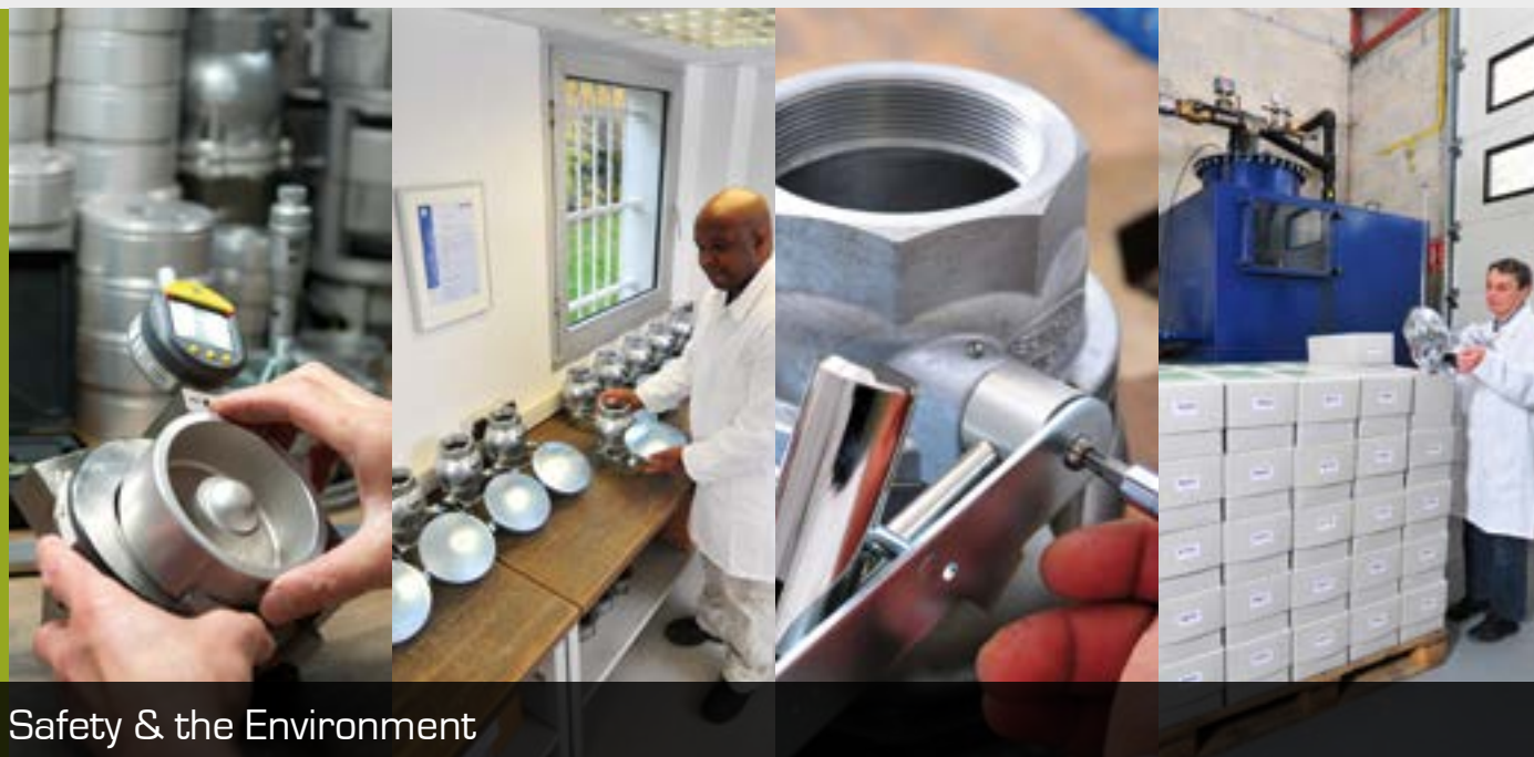
Safety & the Environment

The thorough inspection of incoming parts together with the final testing of the device after production contribute to better product quality and enable its proper operation on delivery to be guaranteed.