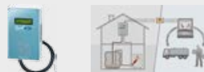
SmartBox 4 illustration diagram

Hydrostatic level probe, reading accuracy 1%, max. tank height 3 m. Compatible with domestic heating oil, water, oil, AdBlue, etc. For other liquids please contact the company.