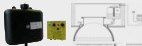
Fuitalarme 16 SC / SC.R illustration diagram

Leak detection system for double wall tanks. ATEX certified - Marking: \text{II (1) G [Eex ia] IICA} . Complies with the French NF EN 13160-3 standard.