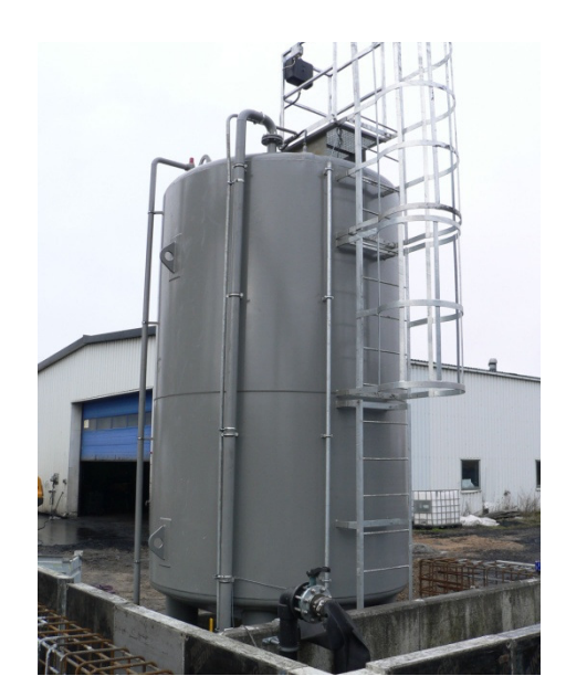
20 m³ tank diameter på 2500 mm. With ladder and platform on top of tank, fill point to ground level, leak detection system etc.