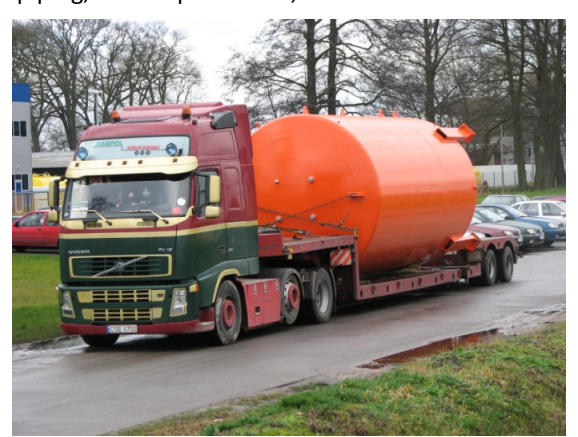
Special tank 51 m³ diameter 3200 mm

The tanks are available with a wide selection of accessories such as ladder / platform / railing, complete piping, overfill protection, etc.